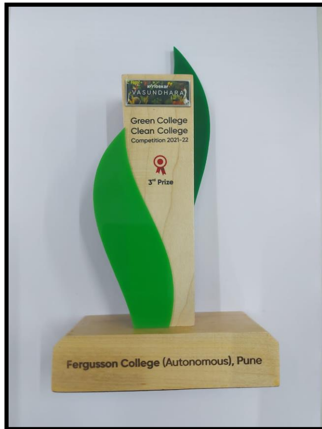
Green College Award Trophy: 2021-22