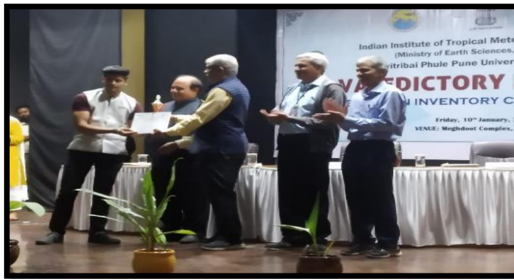
Award ceremony at Indian Institute of Tropical Meteorology (Pune)