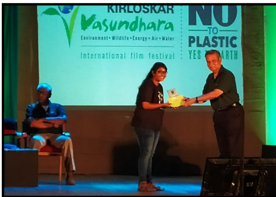
First Prize for Ram Nadi Photo Walk Competition