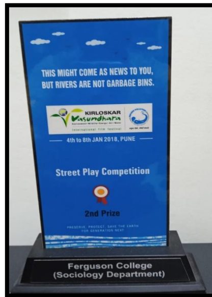
Second prize in street play competition organized by KVIFF 2017-2018