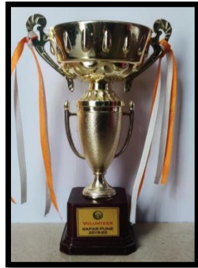
Best Volunteer Award