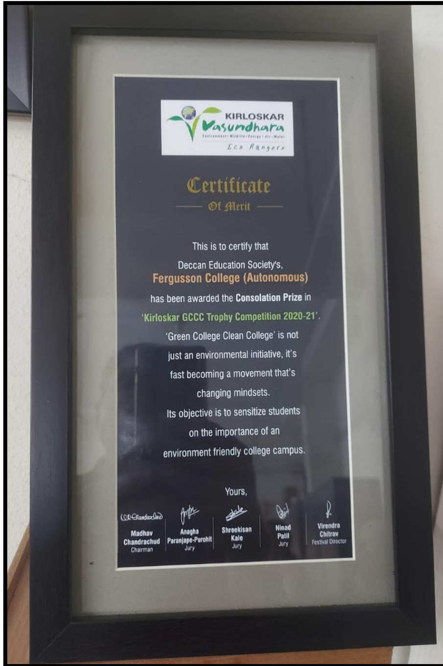
Green College Clean College Award Certificate: Year 2020-21