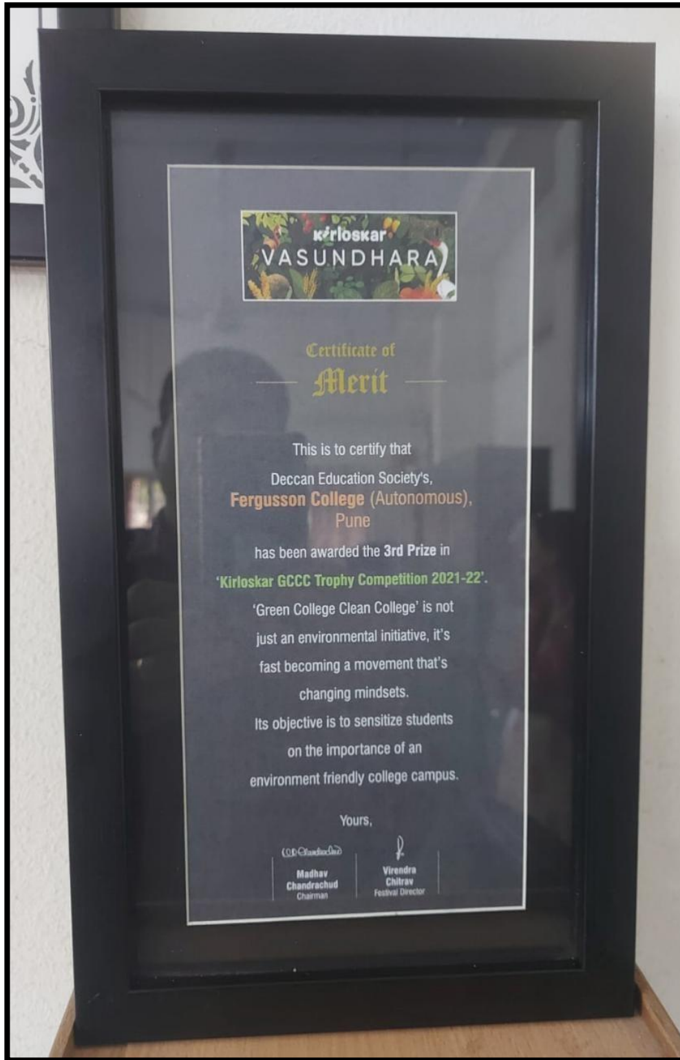
Green College Clean College Award Certificate: 2021-22