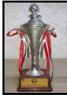
Best Documentary Award